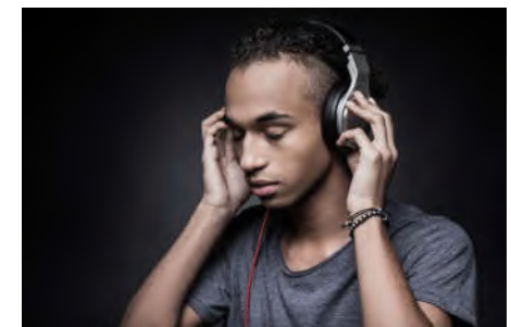
listening to music