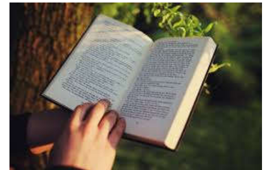
reading a book