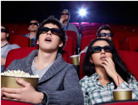
watching a film / going to the cinema