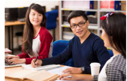
evening classes / learning English