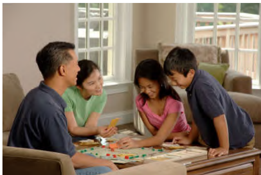
playing board games